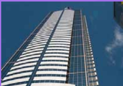
Two Union Square Seattle • Washington Also featured on front cover