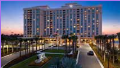
Waldorf Astoria Orlando • Florida Also featured on front cover