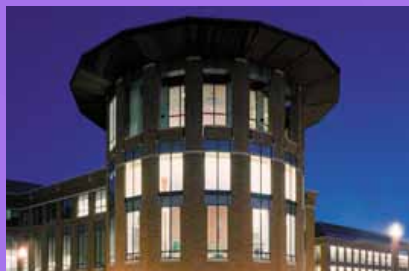
Fisher College of Business The Ohio State University Columbus • Ohio