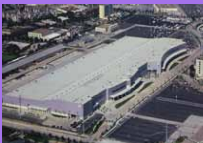
Reliant Center Houston • Texas

Fasten the Soprafix SBS base ply side laps in accordance with industry approvals and SOPREMA instructions.*