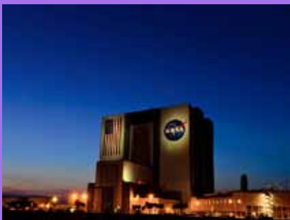
NASA Vehicle Assembly Building Cape Canaveral • Florida Also featured on front cover